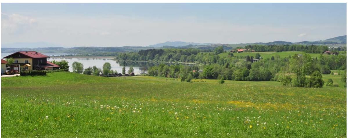
Place for the picnic in Neumarkt

Field trip to Plusregion 1 hour traveling time then picnic