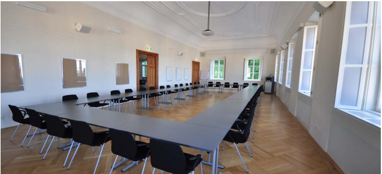
Meeting room in Edmundsburg

Today the Edmundsburg Castle holds the 'Salzburg Centre of European Union Studies', the 'Stefan Zweig-Centre' and a literary archive after the renovation in autumn 2008. The Centre of European Union Studies does scientific and interdisciplinary research on the European society and social care model.