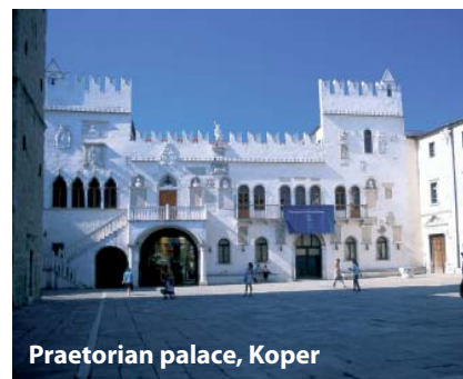
Praetorian palace, Koper

http://www.innocite.eu/Pages/PilotCities.aspx